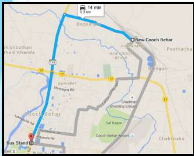
NCB to CGEC

Alternatively Cooch Behar can also be approached by road. The college campus is nearly 5 km from Cooch Behar bus stand.